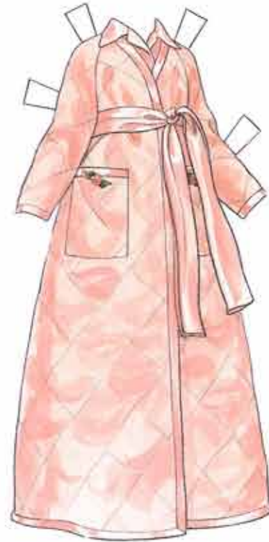
"Sleepy Time" Betsy is ready for bed in her pink satin quilted robe and matching pajamas. Style #001