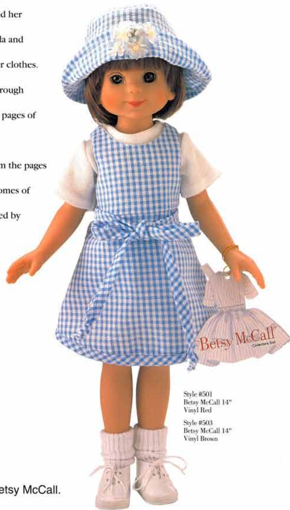
Style #501 Betsy McCall 14" Vinyl Red Style #503 Betsy McCall 14" Vinyl Brown

In September of 1952, Betsy jumped from the pages of McCall's magazine into the hands and homes of her loyal fans as a 14" doll. First introduced by Ideal, this Betsy was also an instant hit.