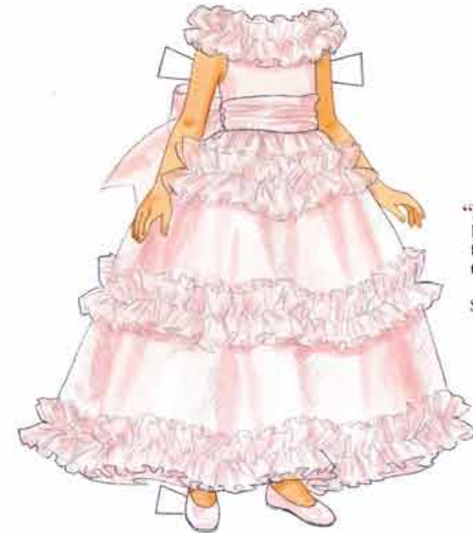
"Pretty in Pink" Betsy looks so glamorous for her first formal dance! She wears a pink tulle and velvet gown. Style #010