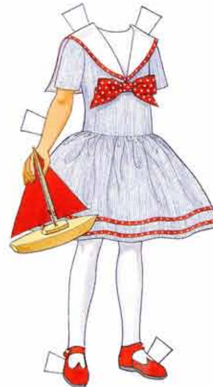
"Going Sailing" Betsy is ready to set sail! Betsy wears a crisp blue and white pinstripe dress with a nice big sailor collar. Style #008